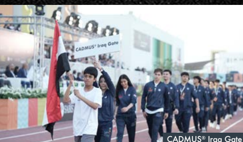
CADMUS® Iraq Gate