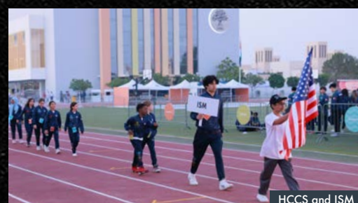
HCCS and ISM