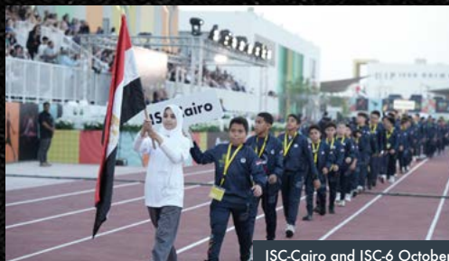
ISC-Cairo and ISC-6 October