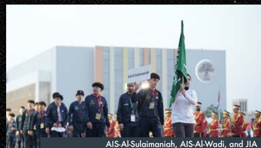
AIS-Al-Sulaimaniah, AIS-Al-Wadi, and JIA