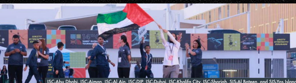
ISC-Abu Dhabi, ISC-Ajman, ISC-Al Ain, ISC-DIP, ISC-Dubai, ISC-Khalifa City, ISC-Sharjah, SIS-Al Bateen, and SIS-Yas Island