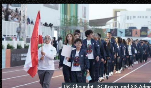
ISC-Choueifat, ISC-Koura, and SIS-Adma